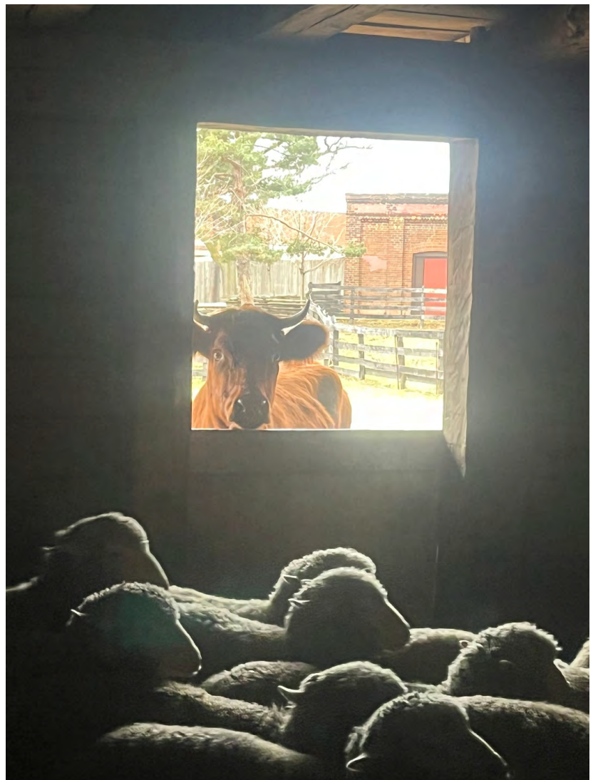
KCF Ruby May at her new home in Greenfield Village (Merinos are in the foreground).

We don't normally deliver livestock we sell to our buyers, but in this instance Greenfield Village did not have to twist my arm to get me to bring the cow to them and fit in a little time to visit the site. The only other time I had been there was as a child visiting with my family. The museum was gracious enough to give us a private tour of their vast agricultural implement collections